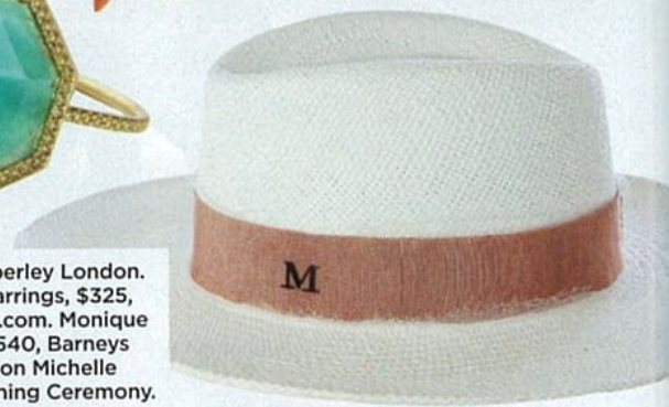
FROM LEFT Temperley London. Pamela Love earrings, $325, pamelalovenyc.com . Monique Péan ring, $10,540, Barneys New York. Maison Michelle hat, $472, Opening Ceremony.