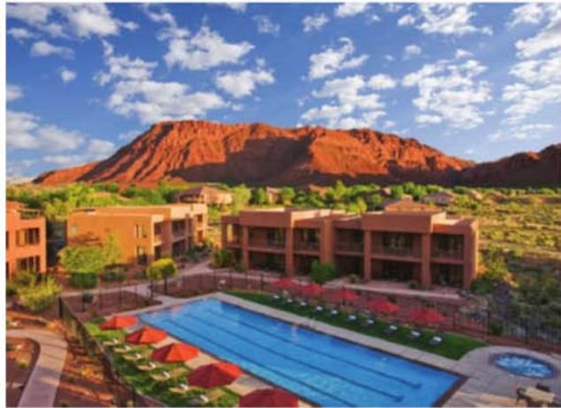
AERIAL VIEW / RED MOUNTAIN RESORT