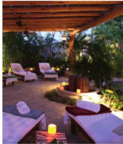
RELAXATION LOUNGE / SPA AT ESPERANZA