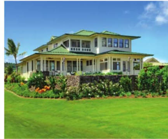
MAKAI COTTAGE / KUKUI'ULA