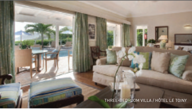
THREE-BEDROOM VILLA / HÔTEL LE TOINY