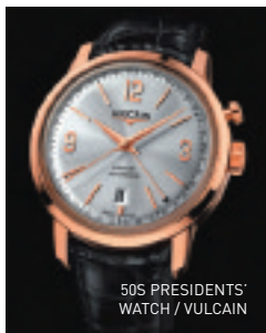
50S PRESIDENTS' WATCH / VULCAIN

Swiss watchmaker Vulcain has an ongoing history with U.S. presidents dating back to 1947 and Harry Truman. Vulcain's innovative Cricket alarm calibre was the first wristwatch to successfully incorporate a miniature striking mechanism and was presented to Mr. Buck-Stops-Here and virtually every other American president since (it has been simply dubbed "the Presidents' Watch "). In celebration of this tradition, and of the general spirit of the 1950s, the company has released the Vulcain 50s Presidents' Watch . The look and feel of