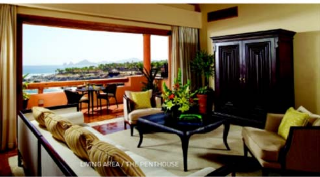
LIVING AREA / THE PENTHOUSE