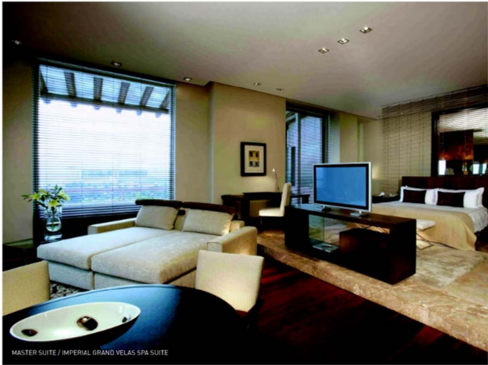
MASTER SUITE / IMPERIAL GRAND VELAS SPA SUITE