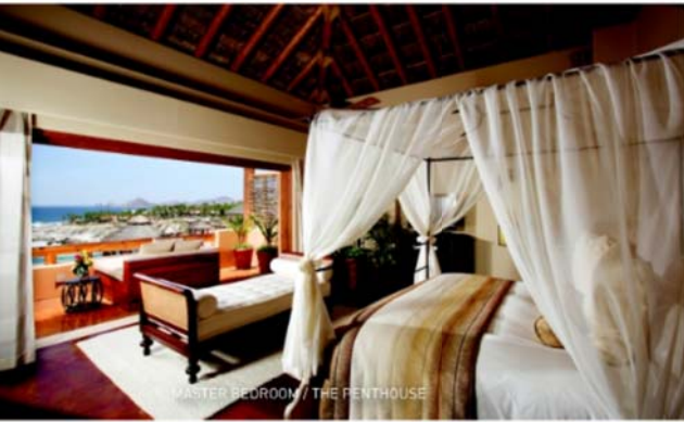
MASTER BEDROOM / THE PENTHOUSE