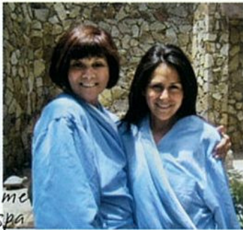
Mom and me at the spa