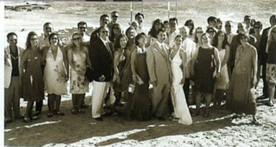
All 36 of our guests