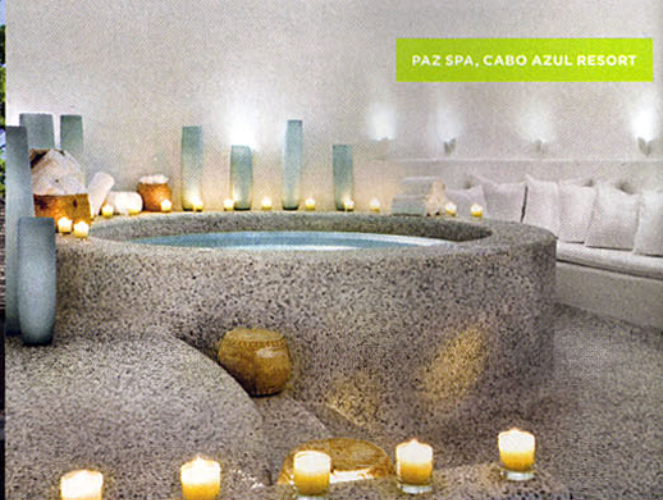
PAZ SPA, CABO AZUL RESORT