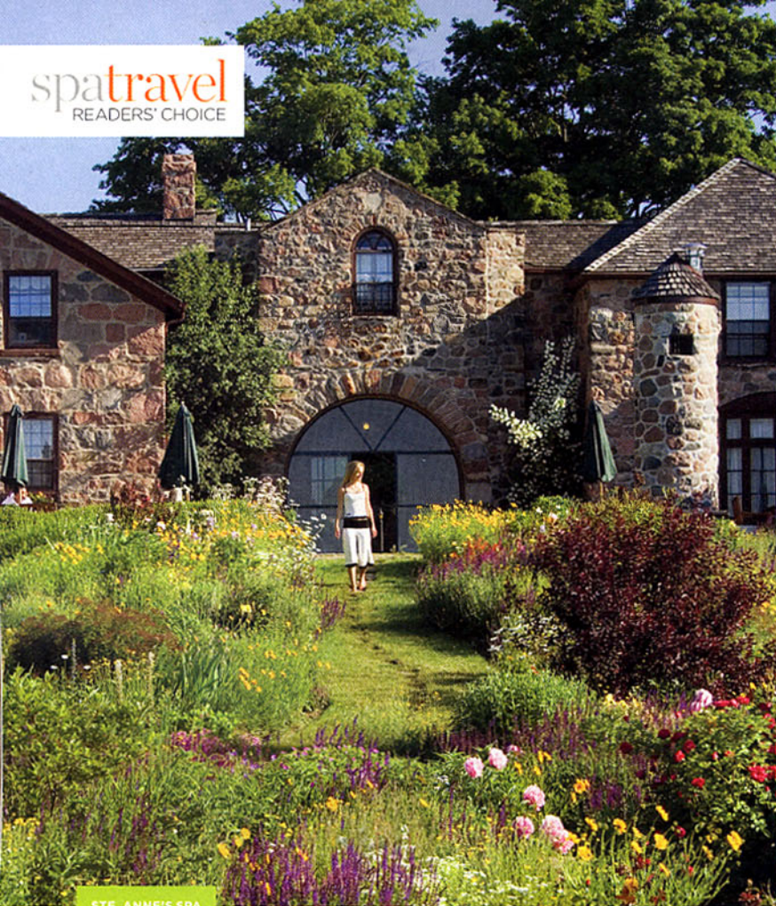
STE. ANNE'S SPA