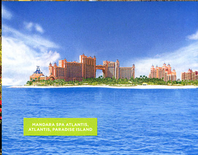
MANDARA SPA ATLANTIS, ATLANTIS, PARADISE ISLAND