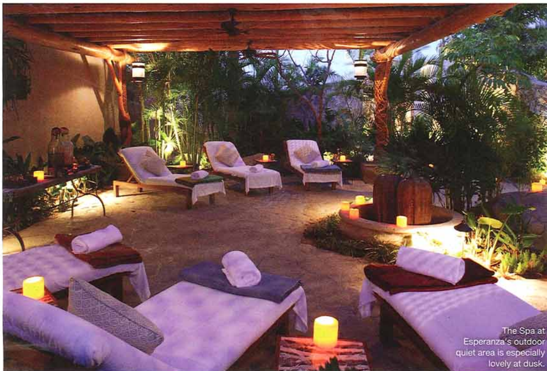
The Spa at Esperanza's outdoor quiet area is especially lovely at dusk.